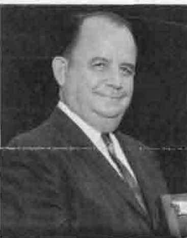
Governor John Dalton predicts ten thousand students to attend the St. Louis Campus by 1973

The Field Club had its problems. They called it the Field Club for a very simple reason; it was way out in the fields. To complicate matters Henry