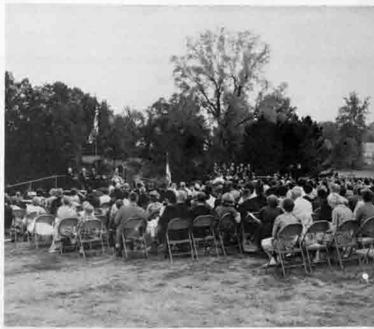
Between 1000 and 1500 people attended the dedication ceremony despite threatening weather conditions.