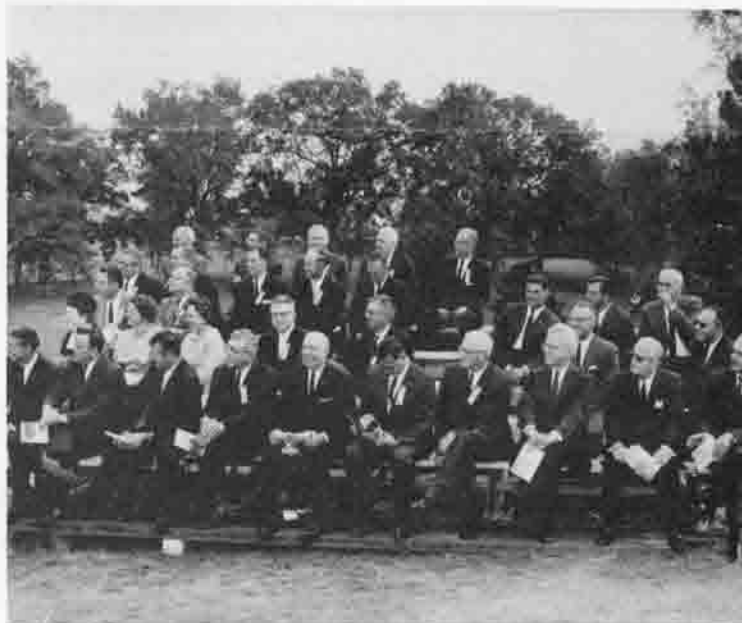
The Committee of Twenty-Eight, citizens of Normandy, who were responsible for the organization and foundation of the four year branch of Missouri University, The St. Louis Campus and other dignitaries who attended the dedication ceremonies.

The Normandy Residence Center officially became the property of the University of Missouri at a dedication on the campus Sun-