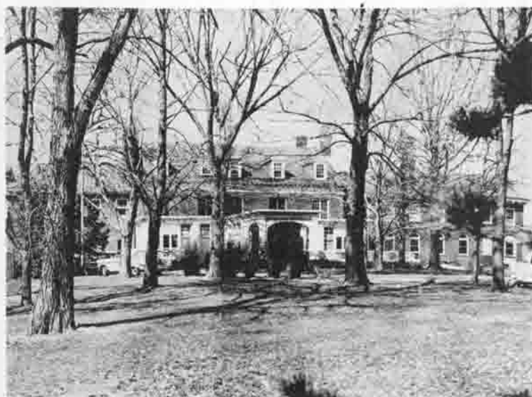
The St. Louis Campus, which was formerly the old Bellerive Country Club, as it exists today.

After the dedication ceremonies, guests were invited to tour the building and view the three-dimensional model of the proposed campus development on display in room 108. Guest speakers and dignitaries received visitors on the patio and punch was served on the northwest tennis court.