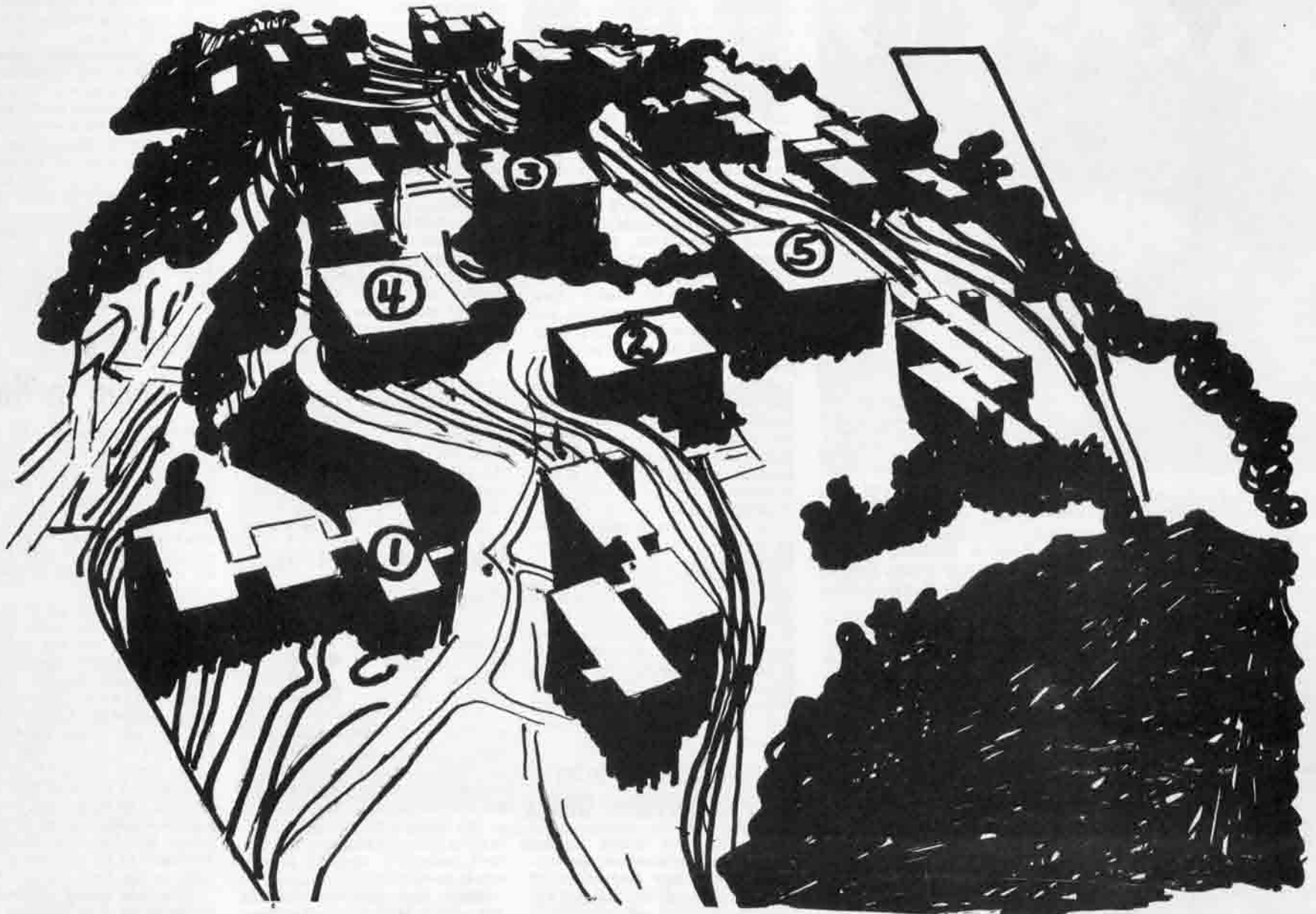
This sketch of the future sight of the St. Louis Campus includes, (1) three-story classroom-lab, (2) administration building, (3) library, (4) communications and fine arts building, and (5) student center. The plan was prepared by St. Louis architects Hellmuth, Obata and Kassabaum Inc.